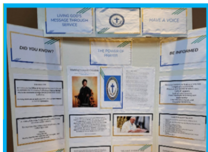
Human Trafficking Storyboard and Presentation