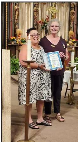
Our new Life Member!