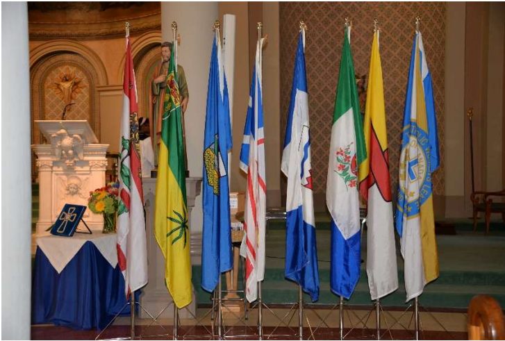
Flags at the Opening Mass